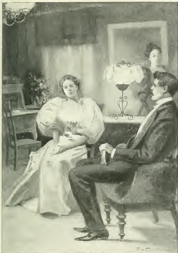
She was beautiful in her evening dress.—Page 155